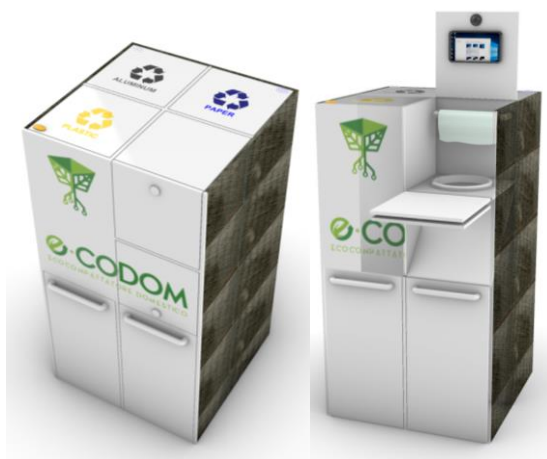
Fig. 4 – Conceptual draw of the smart waste compactor

Except for the steel-covered front part, all vertical sides of the compactor will be coated with a bioplastic (flax fibre mixed with a biocompatible resin) which has already been patented by a company from the project team. In the top surface of the device will be the inlet of three dry fractions (plastic, metal, paper). In the middle inner part of the device, the volume reduction of these three fractions will be obtained by means of crush rollers (i). In the lower part of the device, fractions will be stored into two steel waterproof removable drawers. This will allow the temporary collection of residual liquids inside the drawers without requiring the connection of the whole device to a drain network.